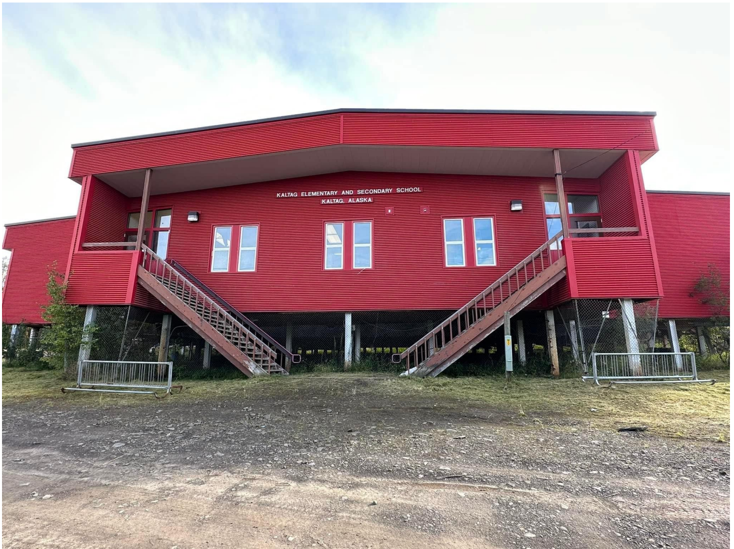
Kaltag Elementary and Secondary School